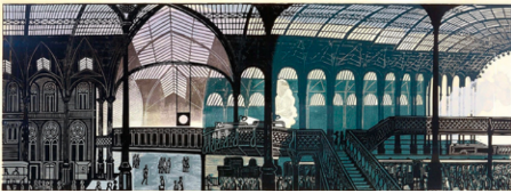
'Liverpool Street Station' Screenprint by Edward Bawden