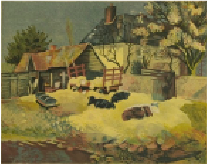
'Essex Farmyard' Lithograph by John Aldridge